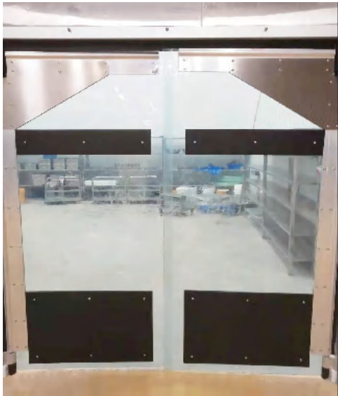
Special Traffic Doors