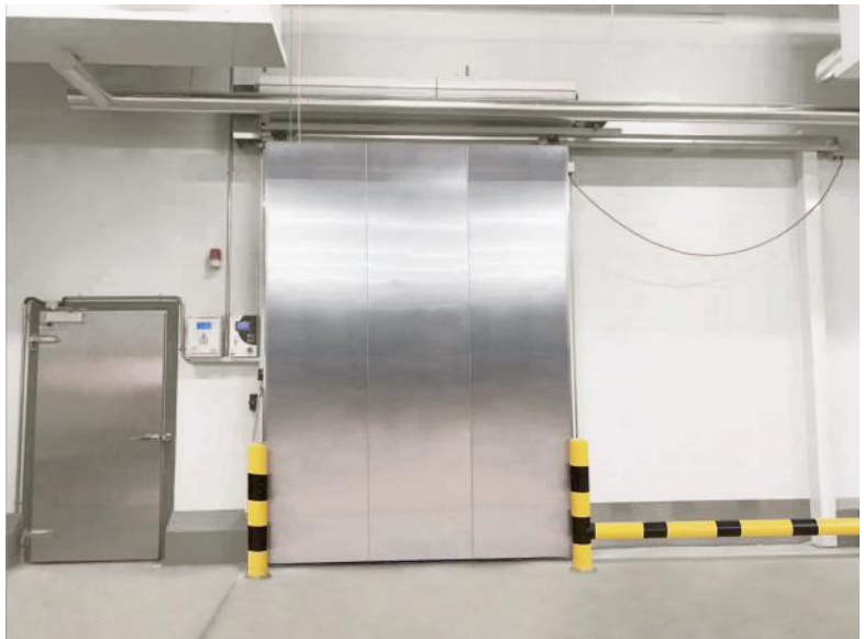
Cold Storage Doors