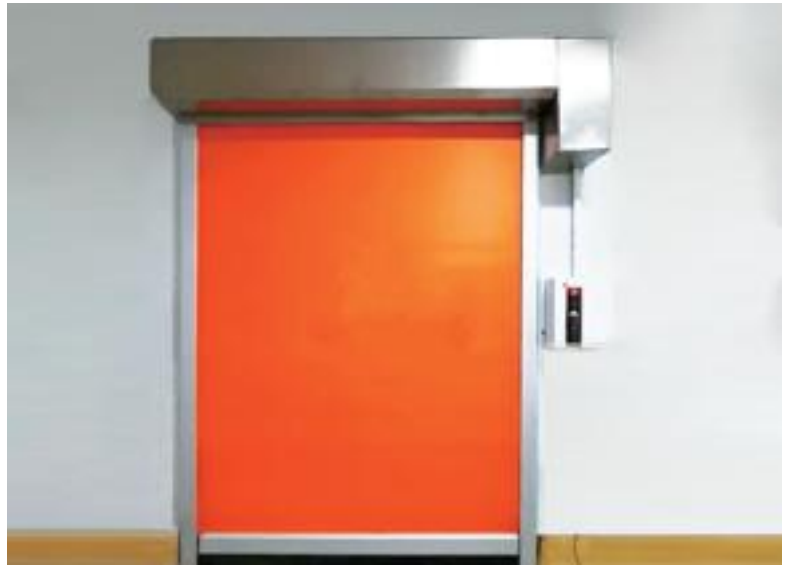
High Speed Doors